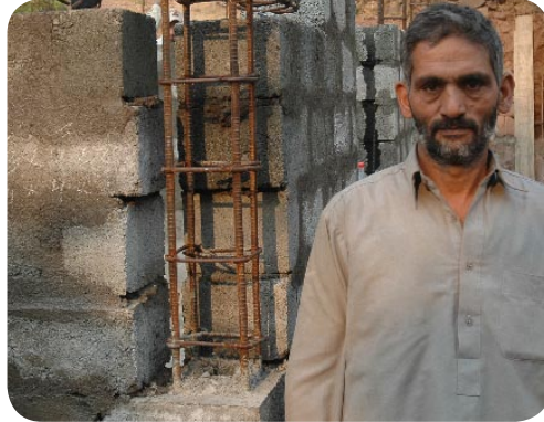
Seek advise to build safer city

For more information and guidelines please contact: