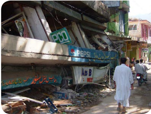
It may happen again